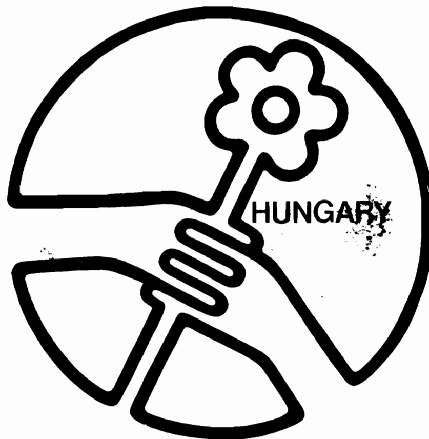
The symbol and badge of the New Hungarian Peace Movement

The independent Hungarian peace movement is interested in receiving materials and visits from Western peace activists. They are particularly interested in opening correspondence with schools and universities peace movements, but they cannot at this stage be deluged with visits and correspondence. If you wish to exchange letters, please write in the first place to: Andrew White, 41 Hodford Road, London NW11 8NL.